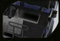
Plastic rear seat kit with storage & cup/cell phone holders