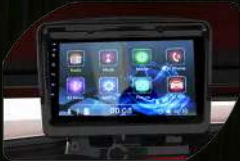
9 inch touchscreen with back-up camera