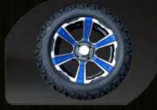
14" Color Matched Off Road Tire