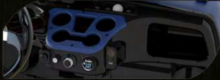
Color matched Dash with four cup holders/cell phone holder