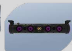
Cylindrical Evolution Sound Bar