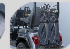
Optional Golf Bag Holder