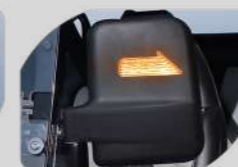
Powered Rear View Mirrors