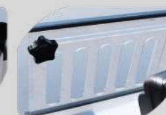
Slideable Air Vents