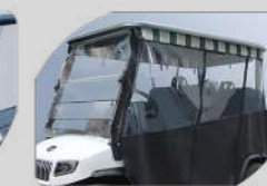
Optional All-Weather Enclosure