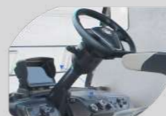
Adjustable Steering Column