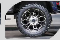
Silent Tire with Off-road Thread