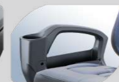
Rear Armrest With Built-in Storage Compartment