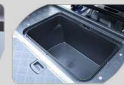
Rear Storage Compartment