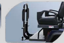
Rear Handrail with Optional Towing Hitch Receiver