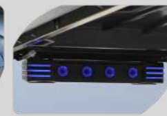
Cuboid Evolution Sound Bar