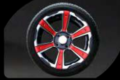
14" Alum Wheel with black insert/215/35R14 Radial DOT Tire