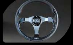
Luxury steering wheel