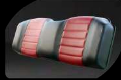
Two tone seat