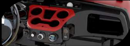
Color matched Dash with four cup holders/cell phone holder