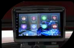
9 inch touchscreen with back-up camera