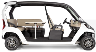
METALLIC PEARL SPECTER WHITE