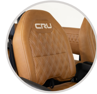
Premium Seating with Color Options