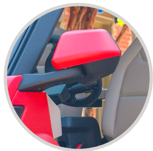
Side Mirrors with Color Options