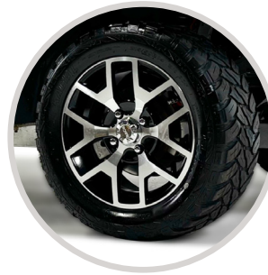
New Atlas/Klever Wheel Assembly