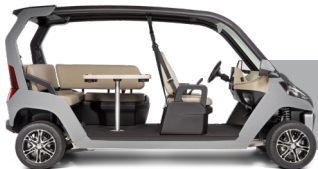
MATTE TITANIUM GREY