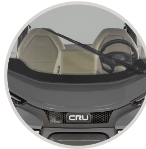
Windshield Wiper/Washer System