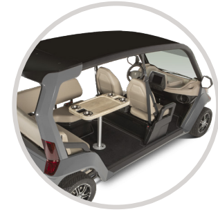
Solid Black Roof