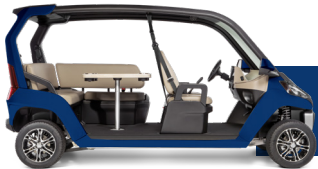
METALLIC SAPPHIRE BLUE