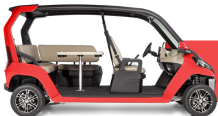
MATTE POWER RED

CRU offers the following features standard: