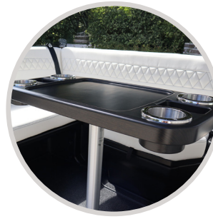
Lounge Table with Color Options