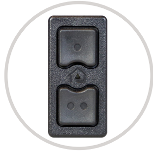
HomeLink® Garage Door Opener