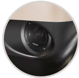
In-Dash Bluetooth Speaker System