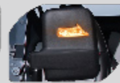
Powered Rear View Mirrors