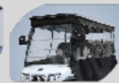
Optional All-Weather Enclosure