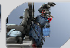
Optional Golf Bag Holder