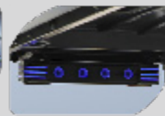
Cuboid Evolution Sound Bar