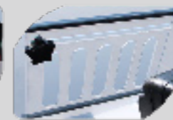
Slideable Air Vents