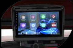
9 inch touchscreen with back-up camera