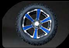
14" Color Matched Off Road Tire