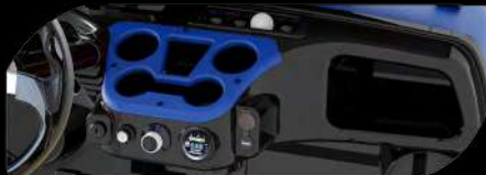
Color matched Dash with four cup holders/cell phone holder