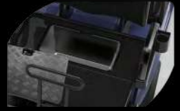
Plastic rear seat kit with storage & cup/cell phone holders