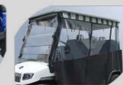
Optional All-Weather Enclosure