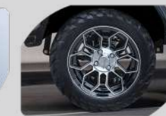
Silent Tire with Off-road Thread