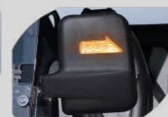
Powered Rear View Mirrors