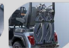
Optional Golf Bag Holder