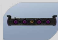
Cylindrical Evolution Sound Bar