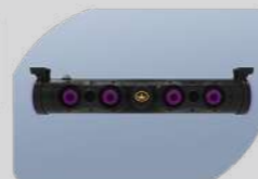
Cylindrical Evolution Sound Bar