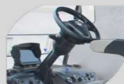
Adjustable Steering Column