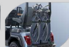
Optional Golf Bag Holder