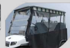
Optional All-Weather Enclosure