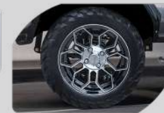
Silent Tire with Off-road Thread