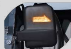
Powered Rear View Mirrors