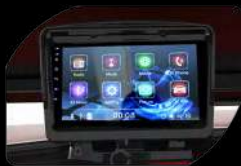
9 inch touchscreen with back-up camera