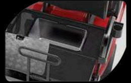
Plastic rear seat kit with storage & cup/cell phone holders