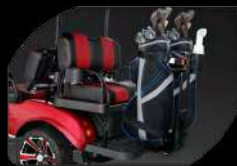
Golf bag attachment & sand bottle kit