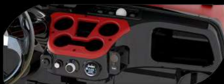
Color matched Dash with four cup holders/cell phone holder