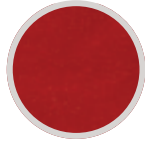
Candy Apple Red Metallic