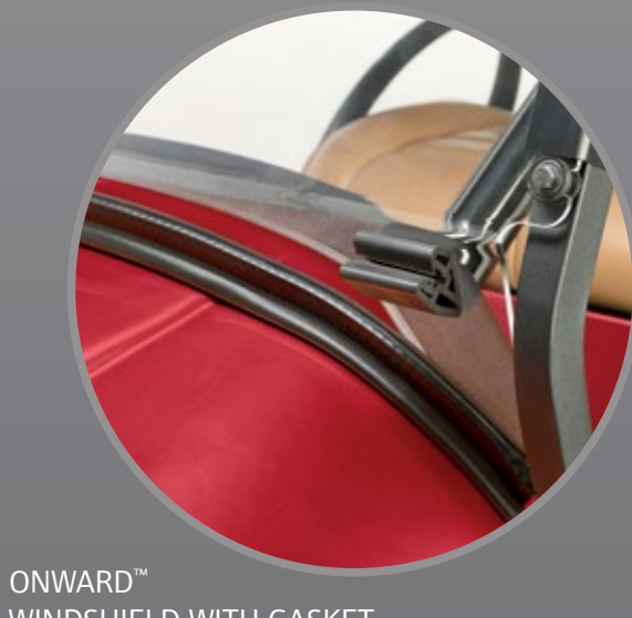
WINDSHIELD WITH GASKET

Opt for a sun-shielding canopy, noise-dampening windshield, and rain-deflecting fender flares for a more comfortable ride.