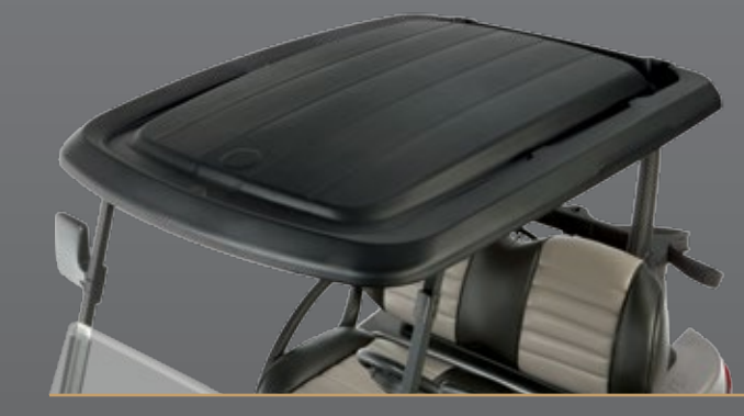
TWO-PASSENGER MONSOON CANOPY