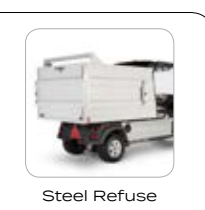
Steel Refuse Package