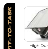
High Dump Package