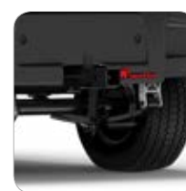
Rear Receiver Hitch